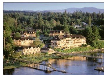
Painters Lodge, Campbell River BC